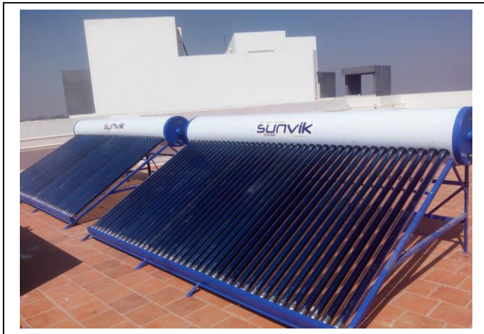
GI/PC 1.2MM GI AIRVENT SYSTEMS