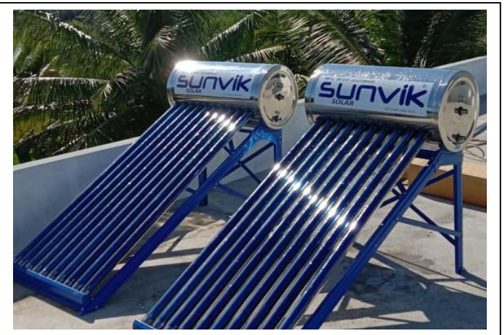
SS/SS 0.8MM ALL SS AIRVENT SYSTEMS