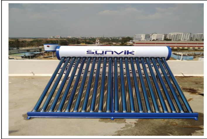
SS/PC ASSISTANT TANK SYSTEMS