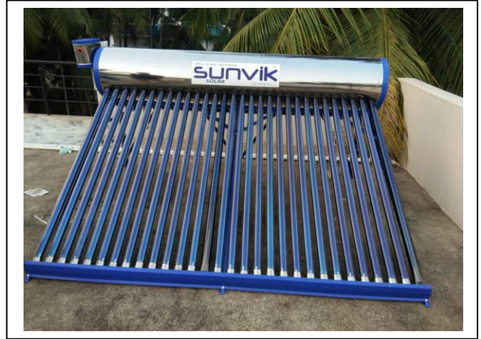
SS/SS ASSISTANT TANK SYSTEMS